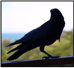
Julie Greig's photo 'Aussie Crow'